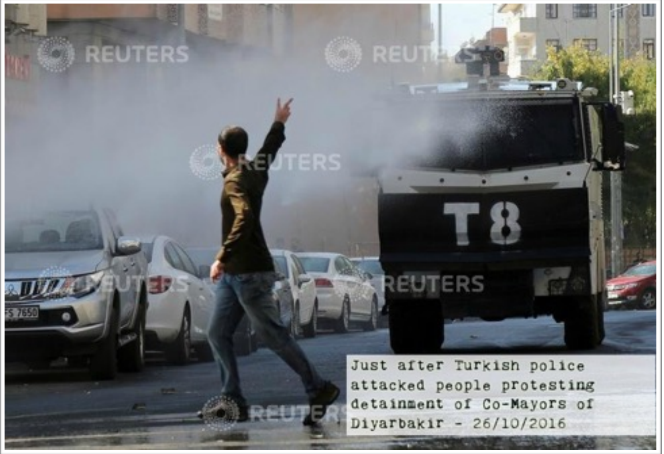
Just after Turkish police attacked people protesting detainment of Co-Mayors of Diyarbakir - 26/10/2016