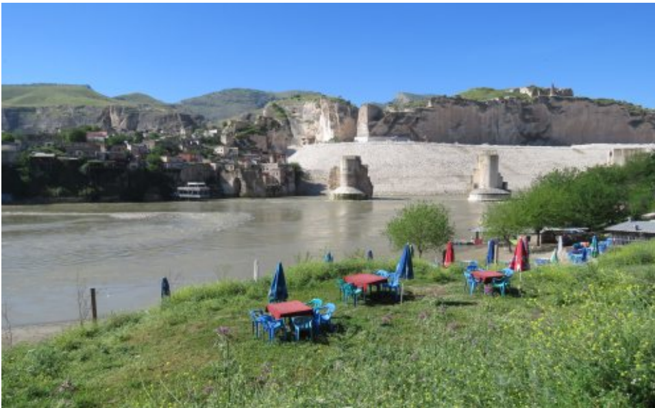
Image 8: The new dam around the Castle Rock

In 2019 the dam around the Castle Rock has been completed and rises into the landscape of Hasankeyf. Its official aim is to ‘consolidate’ the Castle Rock which would be destroyed by surrounding water by time as it is composed by chalk. This chalk was the reason for the fascinating morphology of the Tigris Valley.