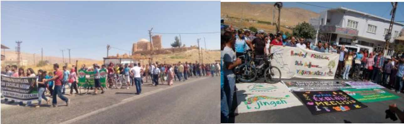
Images 9+10: 1st Global Hasankeyf Action Day, 20.09.2015, Hasankeyf

In May 2016, an international symposium was organized in Batman by the Initiative to Keep Hasankeyf Alive. Apart from raising public interest, the discussions centered around the questions whether and how the struggle can be intensified and how an UNESCO process could be initiated. Both this initiative and the Europa Nostra process came to a standstill when in July 2016 the state of emergency was declared in Turkey just after the failed military coup.