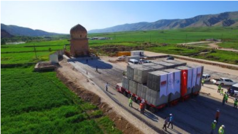
Image 5: Zeynel Bey Tomb during relocation in May 2017

The official claim of rescuing Hasankeyf consists mainly in the relocation of seven monuments to the ‘Hasankeyf Cultural Park’. The preparation for the relocation of the first one, the Zeynel Bey Tomb, started in 2015. The whole process of the relocation was hidden from the public and had no participation by stakeholders, violating existing laws, particularly the tendering and contracting process. With the participation of the Dutch company Bresser Eurasia, the Turkish Er-Bu Insaat could finally relocate the Zeynel Bey Tomb on May 12, 2017. Considering that there is globally no similar relocation experience of a monument of such an age (550 years old) with binding agent technology and the monument is very fragile and in poor condition (there are splits in the cupola) it was a very risky action. Still the monuments stays in its new location, but as no independent experts could examine the monument it is unclear what kind of damage it experienced.