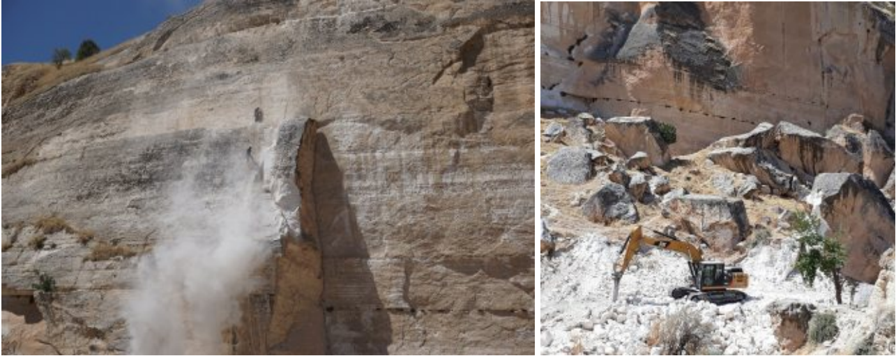
Images 6+7: Destruction of one rocks piece in mid of August 2017; Heavy equipment working with debris

Rizk Mosque would be cut and relocated to the cultural park area in New Hasankeyf 11 . Apart from the bridge one more monument has been covered by stones as a ‘restoration and rescue’ work. However, despite these so called ‘rescue projects’ several hundred monuments would be submerged and with time under water destroyed. Now the relocated seven monuments are situated close to each other what they have not done for hundreds of years and disconnected from the original environment. That is why it is a museum and nothing more.