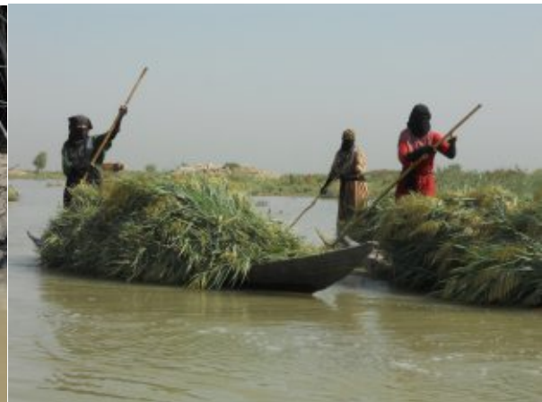
Images 2 and 3: Soft Shell Turtle; Marsh Arabs in the South Iraqi Marshes