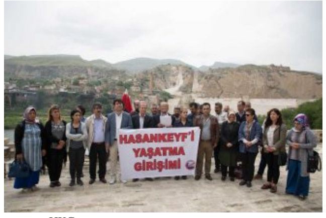
Images 11+12: Actions days for Hasankeyf, 2017 and 2018