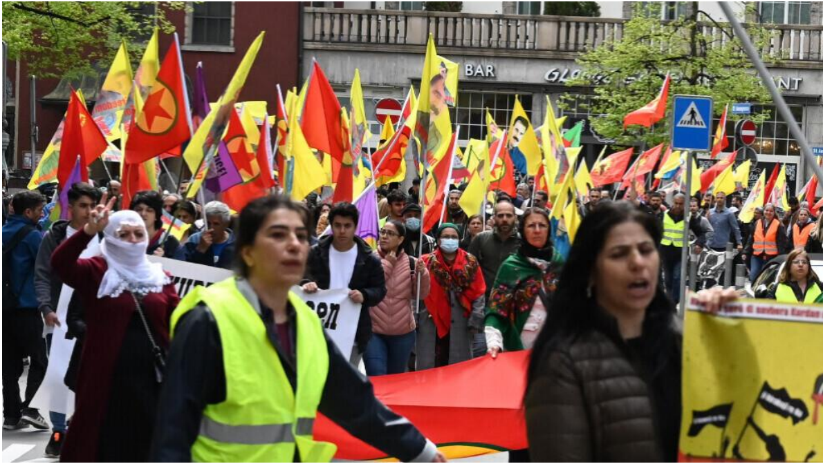
Kurdish people demonstrating against Turkish invasion in South Kurdistan