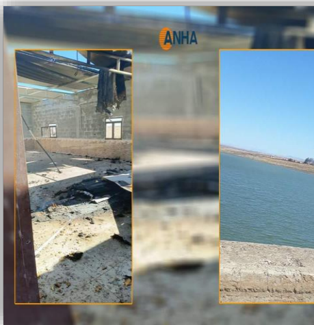
The targeting of the Jal Agha/Jawadiya Dam